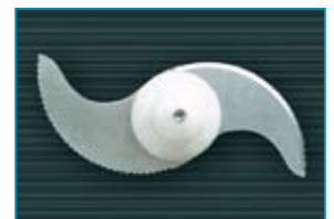
lama dentata per tritare toothed blade for mincing lame dentée pour hacher