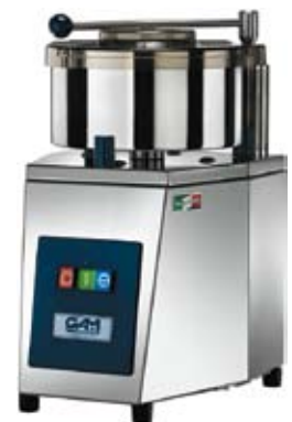
PROFESSIONAL L 8

Hygiéniques: parce qu'ils sont réalisés entièrement en acier Inox et plastique pour aliments.