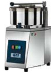
COMPACT L 3

Igienici, perché realizzati interamente in acciaio inox e plastica per alimenti.