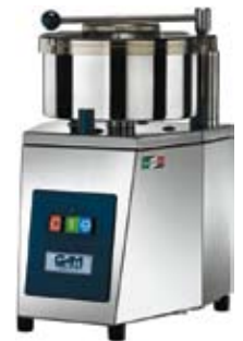
IDEAL L 5

Hygienic, because they are entirely made of stainless steel and plastic for food.