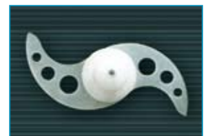
lama forata per montare e impastare pierced blade for whipping and kneading lame percée pour fouetter et pétrir