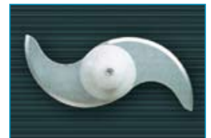
lama standard affilata per tritare standard sharp mincing blade lame standard affilée pour hacher